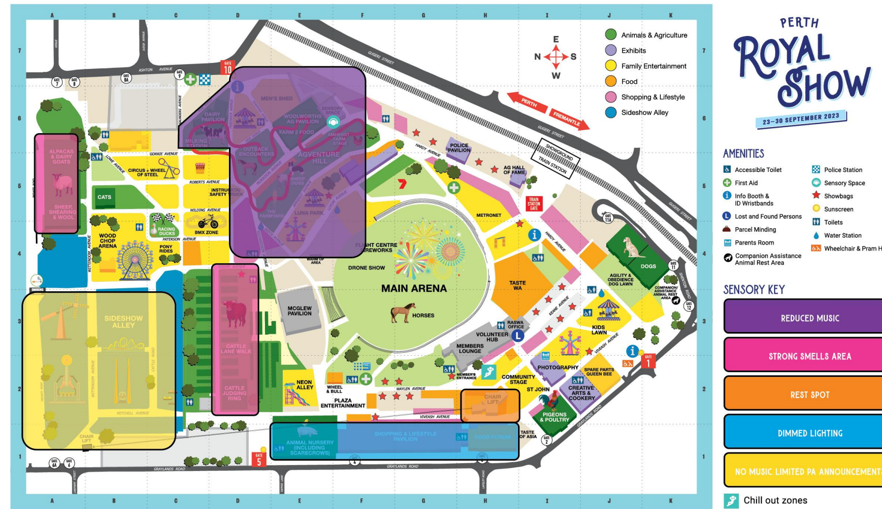
QUIET SESSION SENSORY MAP 10am -11am, Tuesday 26 September 2023

The map also shows the Sensory Space where I can rest with quiet activities.