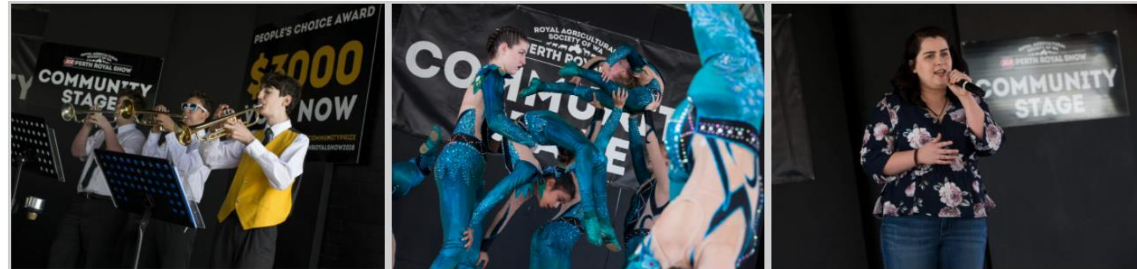
These are pictures of different performances. There is a band, a dance group and a lady singing.

The different events and performances are on at different days and times, so I might only be able to see some of them.