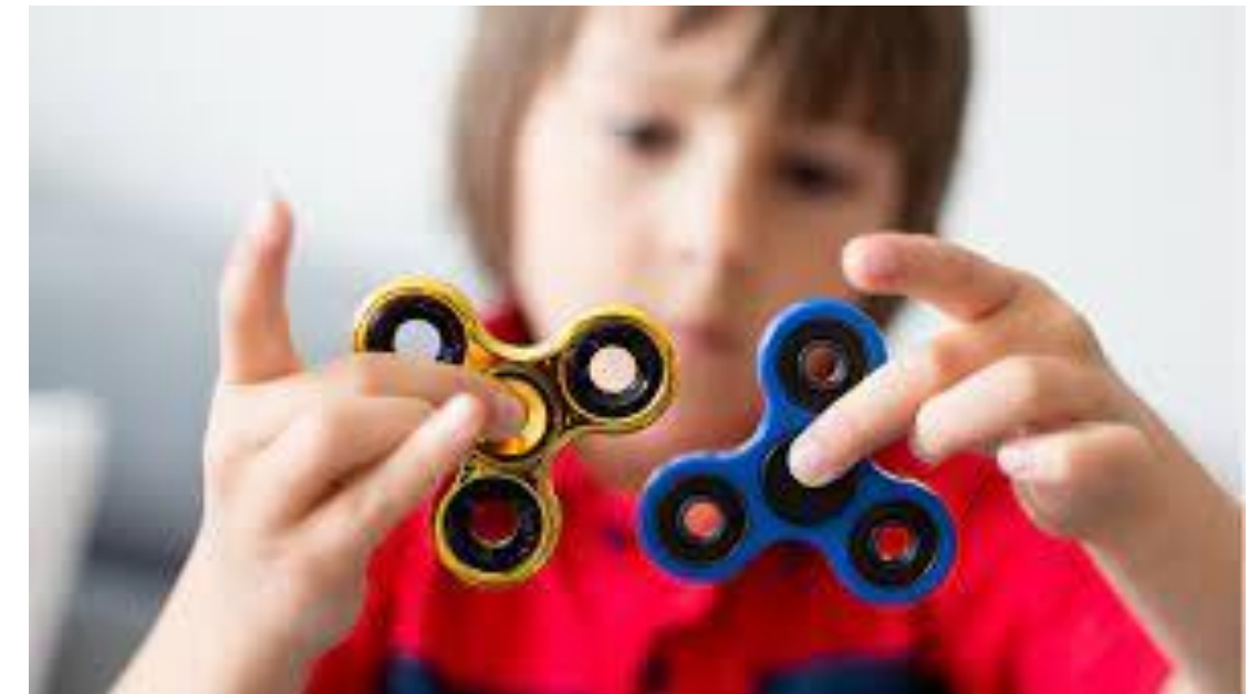
Picture of a child playing with fidget spinners

In the Sensory Space there will be activities that can help me to feel calm and in control such as arts and crafts and reading tents.