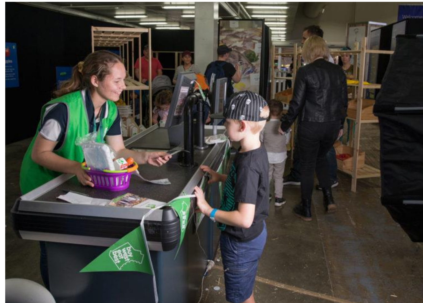
Picture of a lady in a booth helping a young boy.

If I get lost, I can ask one of these people for help.