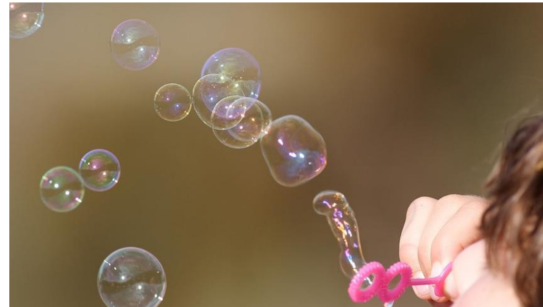
Picture of bubbles being blown.