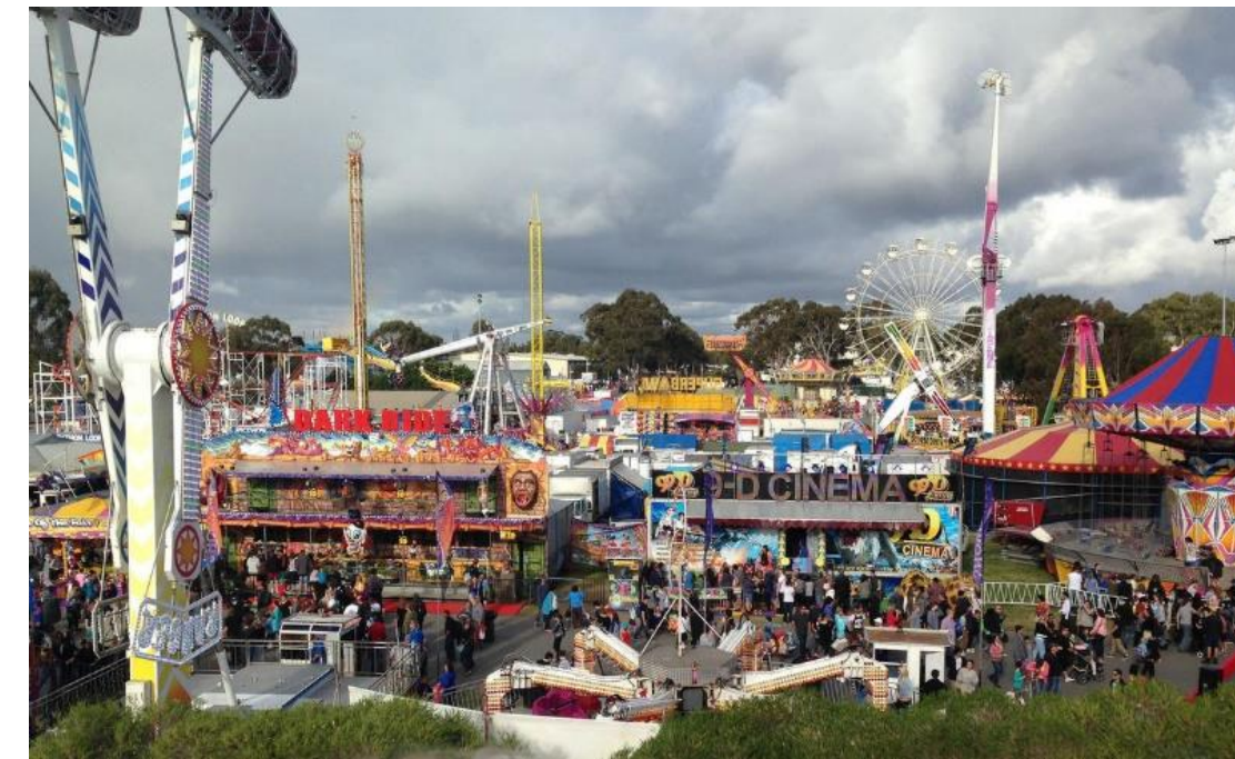
Picture of lots of different show rides.

Everyone likes different rides and there are lots to choose from and they all cost money to go on. I can buy tickets for rides from booths located near the rides. They have signs saying "Tickets".