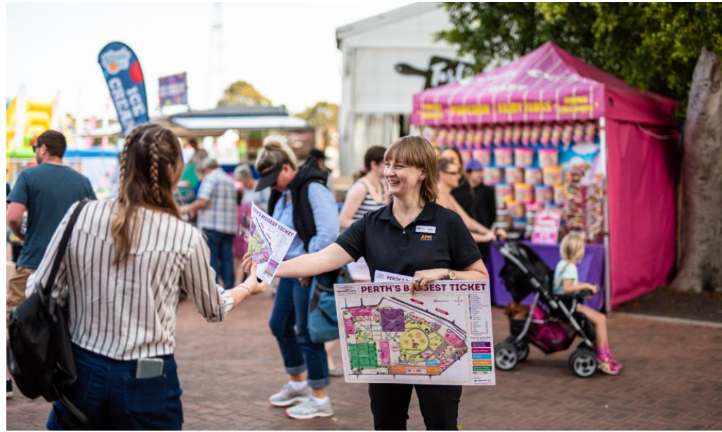
Picture of a lady handing out maps near the entrance.

When I get to The Show, I will go through the gates and hand my ticket to one of the workers. There could be long lines of people waiting to get in. I might need to wait in line before I can go in.