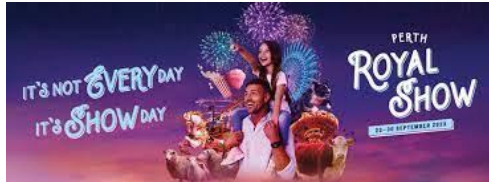
Picture of the Perth Royal Show promotional banner.

Sometimes people must wait for a turn to go on the rides, buy food and drink, go to the toilet, or to look at or pat animals. Waiting in line and taking turns means that everyone will get the chance to see and do the activities they would like to.