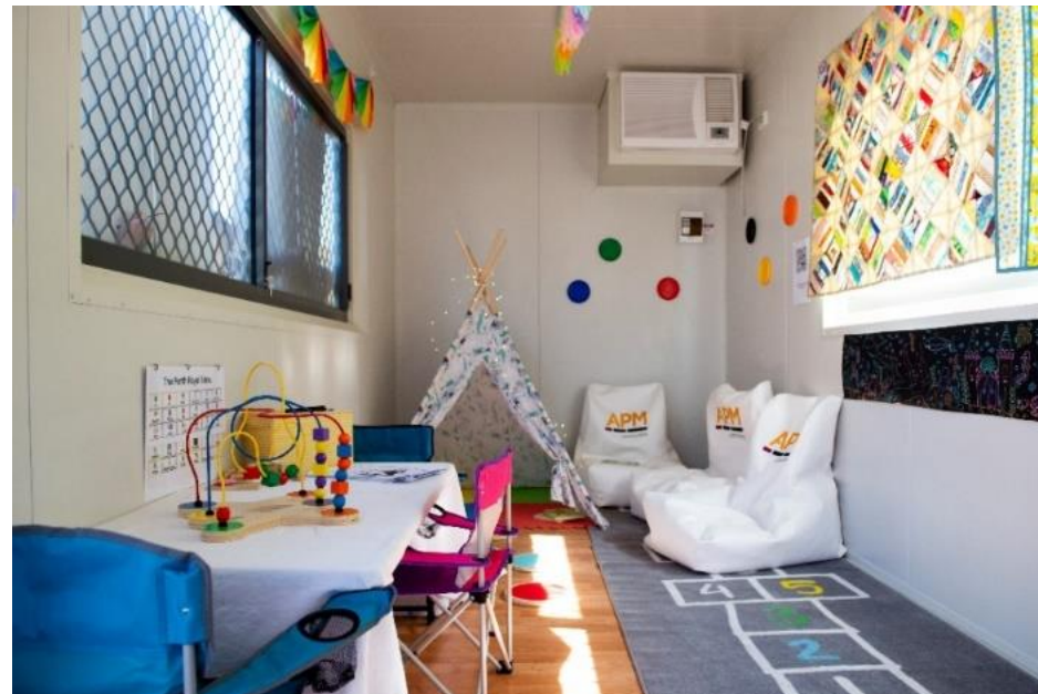
Picture of the inside of a Sensory Space

I may want to go to the Sensory Space after this time. Or I might feel comfortable walking around the Show when the noises start again.