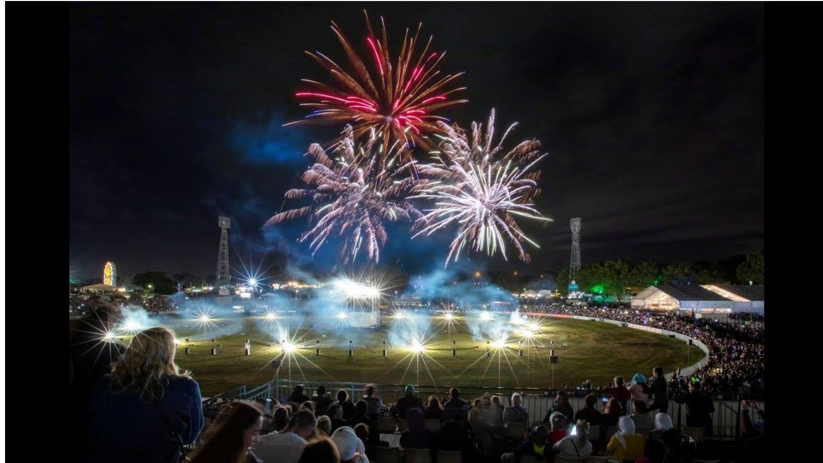
Picture of fireworks at nighttime over a large field

The Perth Royal Show is on in Perth once every year.