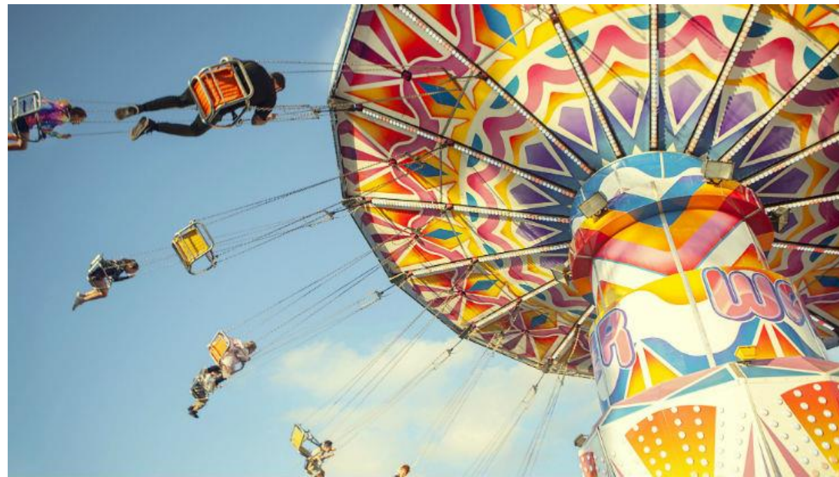
Picture of people on a show ride.

When I am at the Show I might like to go on some rides. My friends and family may choose to go on some rides too.