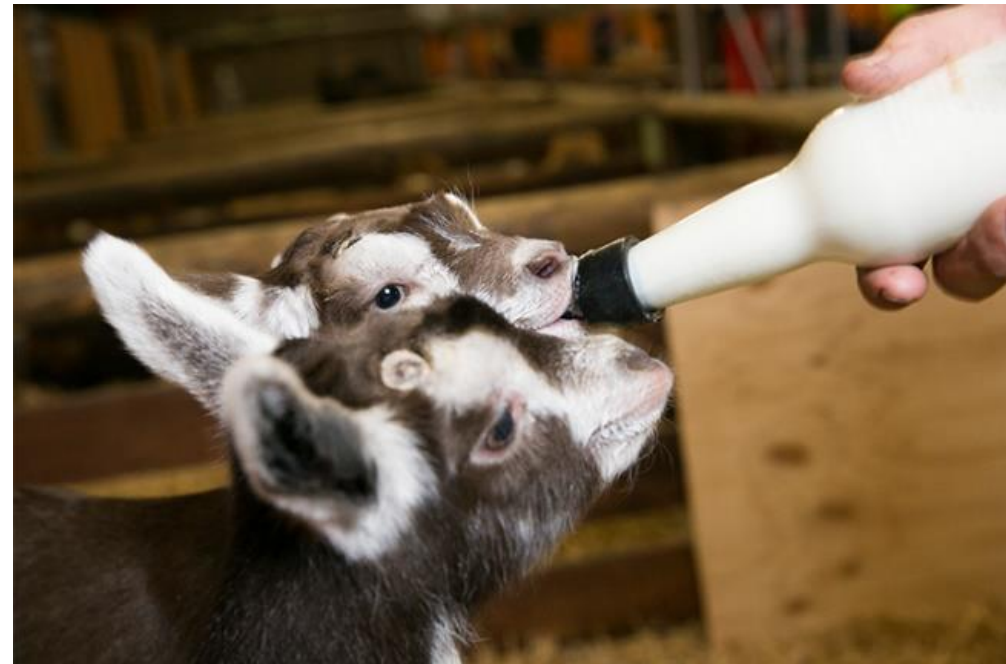
Picture of 2 baby goats being fed with a milk bottle.

There are lots of different pavilions at the show. Some have animals you can pet and some have animals you can feed.