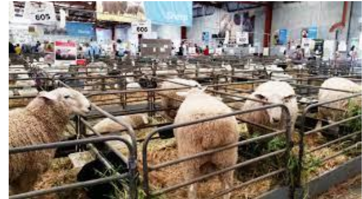
Picture of sheep in a fenced area.

I don't have to feed or pet the animals. I can just look if I like.