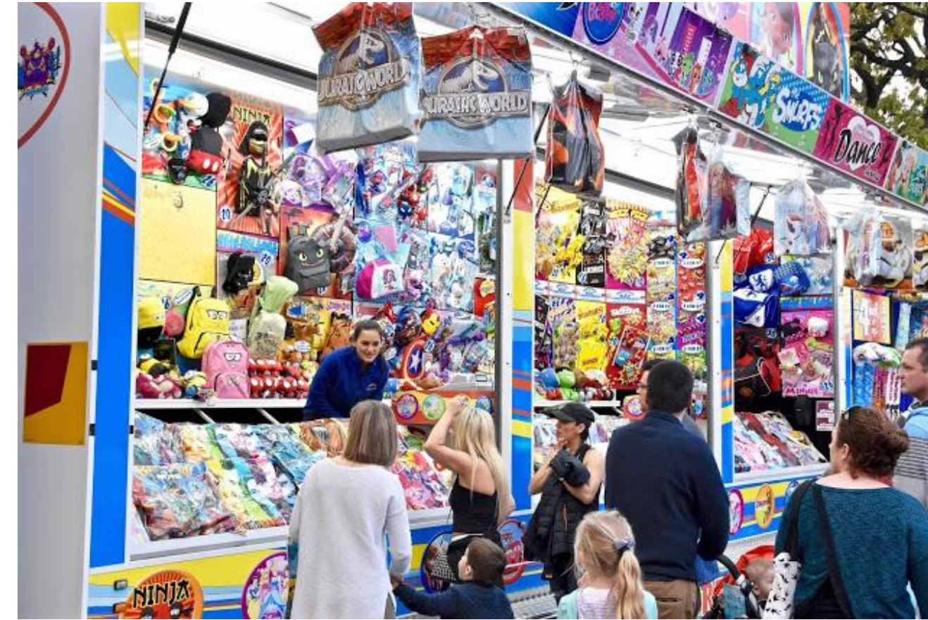
Both pictures show people in lines looking and buying show bags.

I might like to look at the showbags, and I might be able to buy one or some. There are lots of different showbags to choose from, and they all cost money to buy. I might not be able to buy all the ones I want. Sometimes the showbag I want may be sold out and I might need to choose a different one.