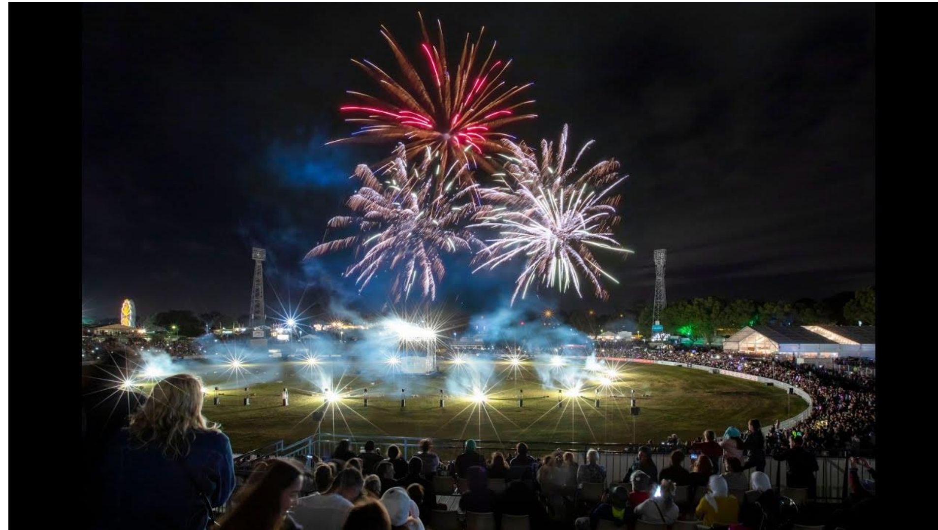
Picture of fireworks at night on a large, grassed area

The fireworks are loud, bright, and colourful. I might be a good idea to bring my headphones if I stay to watch them.