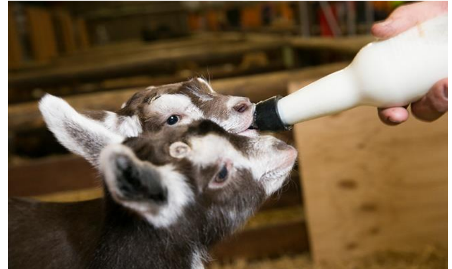
Picture of two baby goats being fed a milk bottle

This year, it will run from the 21 st to the 28 th of September. It has lots of fun activities and things to see and do.