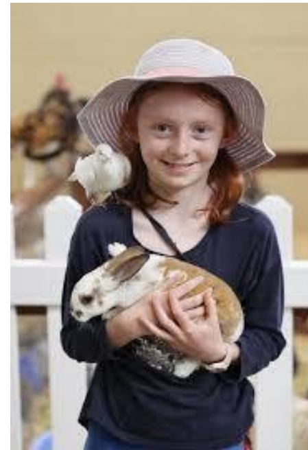
Picture of a young girl holding a rabbit.