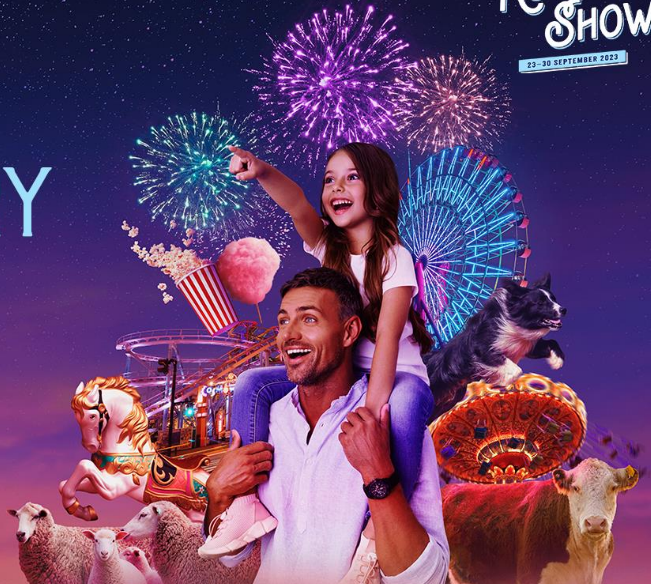
Picture of the Perth Royal Show Banner dated 21 st to 28 th Sept 2024