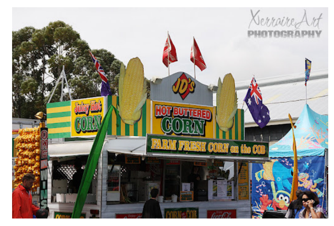
Pictures are of food and drinks stands around the show. There are many to choose from.

Prices can vary depending on what food I eat but here is a lot of choice. It a good idea to bring my own bottle of water to The Show on hot days.