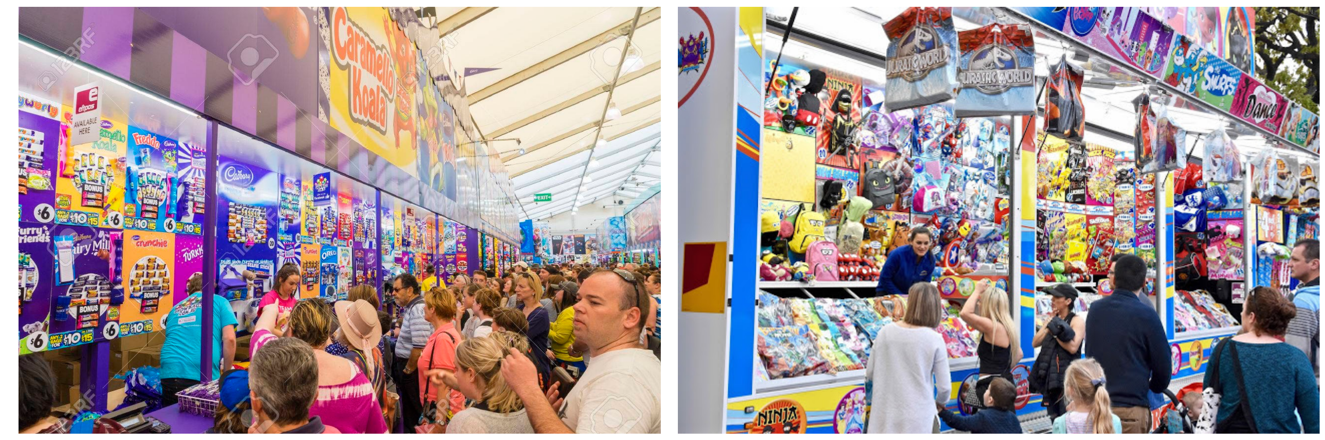
Both pictures show people in lines looking and buying show bags.

I might like to look at the showbags, and I might be able to buy one or some. There are lots of different showbags to choose from, and they all cost money to buy. I might not be able to buy all the ones I want.