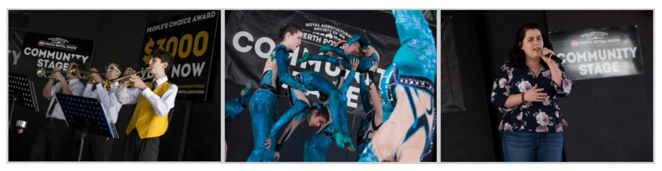
These are pictures of different performances. There is a band, a dance group and a lady singing.

The different events and performances are on at different days and times, so I might only be able to see some of them.